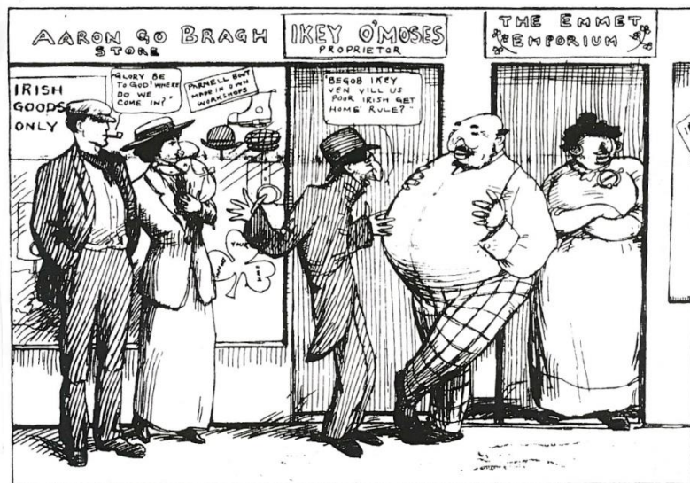
GENTLEMEN OF THE JEWRY